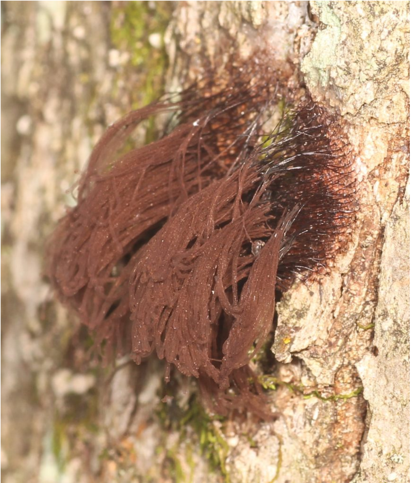
Stemonitis sp slime mold

Slime molds have 2 life phases that have been described as “animal-like, creeping” and “fungus-like, fruiting” states. (Farr, vii) Doesn't knowing that one description intrigue you